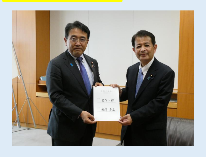
Photo: State Minister Akazawa (left) and former State Minister Miyashita (right)