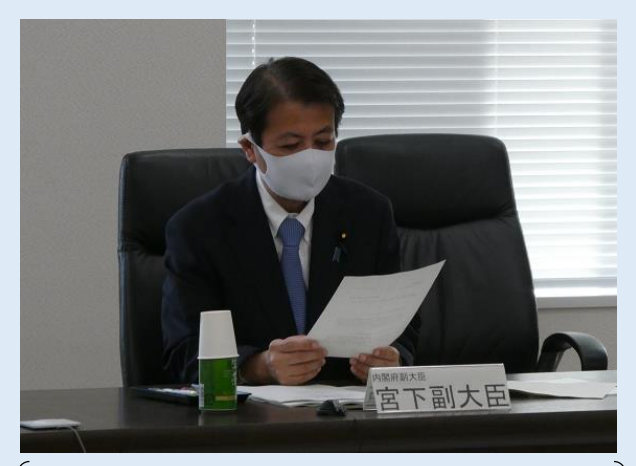
Photo: State Minister Miyashita (then) reading out the consultation document

On September 11, the 44th General Meeting of Financial System Council was held. At the meeting, State Minister Miyashita (then) delivered an opening speech and a consultation was conducted for the first time in nearly three years.