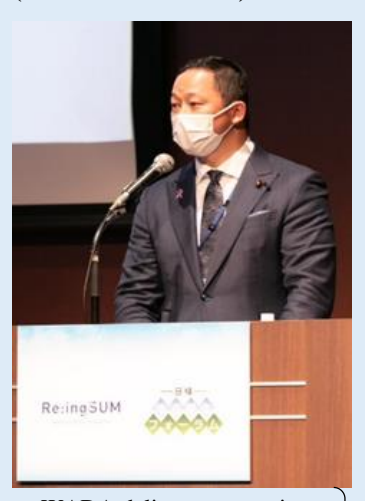
Photo: Parliamentary Vice-Minister WADA delivers an opening speech in the hall.

Parliamentary Vice-Minister WADA in his opening speech not only stressed the importance of regional financial institutions' support for business operators amid the coronavirus crisis but also pointed out that the improvement of their with abilities to cope changes from long-term perspective is indispensable for their support of business operators and regional economic vitalization.