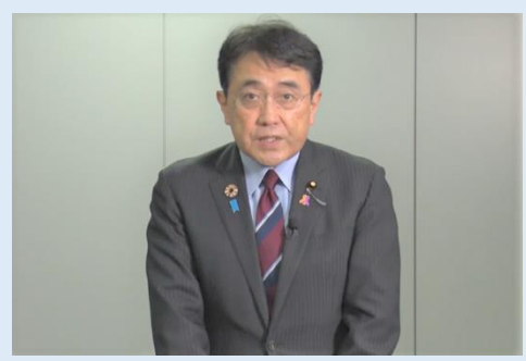
Photo: State Minister AKAZAWA delivers a video message as an opening speech

State Minister AKAZAWA in his opening speech stressed the importance of regional financial institutions taking advantage of business opportunities: found even under tough management environments caused by the spread of the COVID-19 infection, to not only mediate the flow of capital but also to mobilize all of their intermediation functions, such as those for people, goods and information, to support local business operators and support local industries.