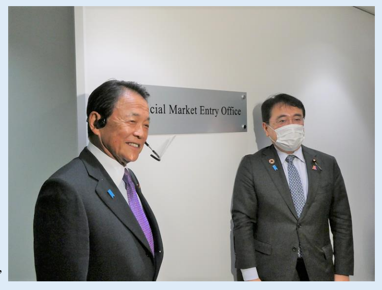
Photo: Minister ASO, left, and State Minister AKAZAWA, right, pose by the signboard in a ceremonial press photo

Various programs, such as promotion of reforms to make the financial and capital markets as attractive as those overseas and establishment of an environment that attracts overseas businesses and highly-skilled foreign professionals, are being strategically implemented on an "all Japan" basis to expand Japan's role as an international financial center. All parties concerned will work together to promote the Office as a key contributor to the goal.