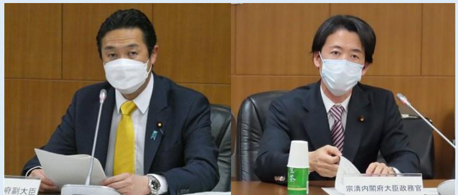
( Photo: State Minister KIKAWADA and Parliamentary Vice-Minister MUNEKIYO give remarks during the meeting with Directors-General of Local Finance Bureaus. )

During the meeting with local financial bureau chiefs, the Commissioner and other senior officials of the FSA explained current challenges to its financial policy and measures it has taken to address them, among others, in addition to remarks by State Minister KIKAWADA and Vice-Minister MUNEKIYO. FSA officials and local finance bureau chiefs shared the recognition of the challenges and other issues and confirmed that the FSA and the Local Finance Bureaus will continue to jointly cope with them.