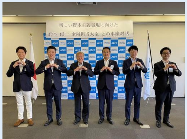
Photo: Participants Note: Participants form a shape of the Japanese kanji character for "eight" with two hands, which means "good in all directions."