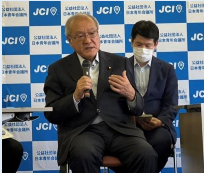
Photo: Minister SUZUKI during the roundtable discussion.

The theme of the roundtable discussion was "Regional financial institutions' escort-type support to foster social mind", and business operators from across Japan attended it.