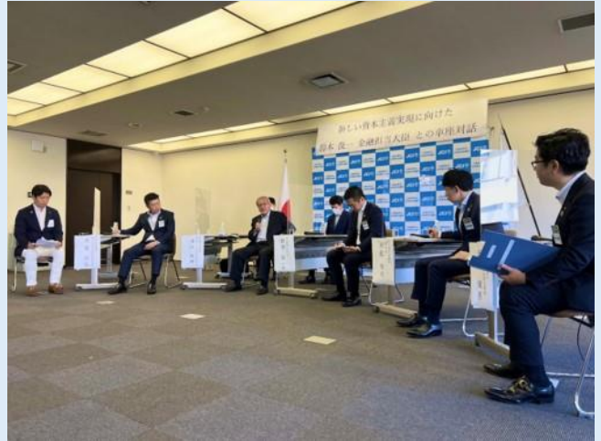
Photo: During the roundtable discussion

The Financial Services Agency (FSA) feels that the discussion was very fruitful as participants brought up specific points and suggestions from their positions.