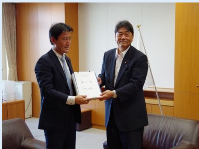
Photo: State Minister Ibayashi (left) succeeding to duties from former State Minister Fujimaru (right)