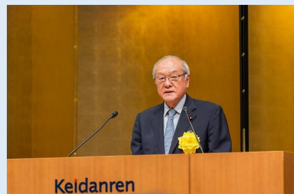
Photo: Minister Suzuki delivering opening remarks

The FSA compiled the Action Program for Accelerating Corporate Governance Reform this April. We will promote a shift of household assets from savings to investment, enhance the asset management business, and increase the attractiveness of Japanese companies and Japanese capital markets as investment destinations, thereby achieving a virtuous cycle of growth and increase of asset-based income.