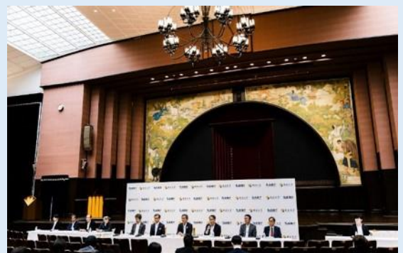
Photo: Press conference held after the conclusion of the agreement at the Yasuda Auditorium

Furthermore, it is also expected that the analysis of data held by the FSA will be promoted in the form of a joint research with the University of Tokyo, and this will deepen FSA staff's understanding of financial markets and enable them to utilize their knowledge in actual financial administration. In addition, financial and economic education, an area the FSA has been working on together with the national government, will be promoted more effectively through the collaboration with the University of Tokyo. But first of all, we will advance firmly the joint research that we commenced this April, and will examine the theme of the next joint research as we coordinate research needs of both institutions.