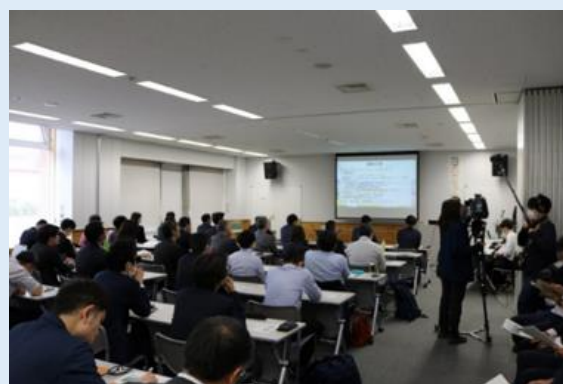
Photo (both): Meeting for Acquiring Important Fans of Asahikawa City