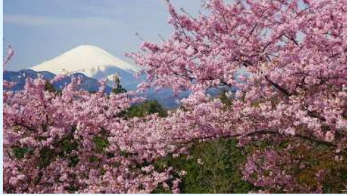
Beautiful Cherry blossoms with Mt. Fuji

We wish that you and your family remain safe and well.