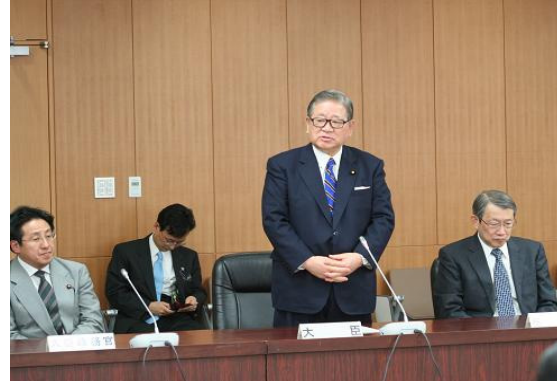
Greeting by Minister Shozaburo Jimi at Meeting of Directors-General of Local Finance Bureaus (January 27)