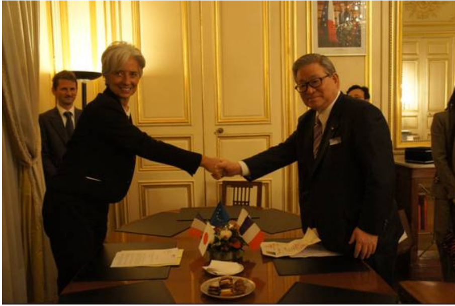
Christine Lagarde, French Minister of Economic Affairs, Finances and Industry (left) shakes hands with Minister Shozaburo Jimi

In Belgium, he held a meeting with European Commissioner Michel Barnier.