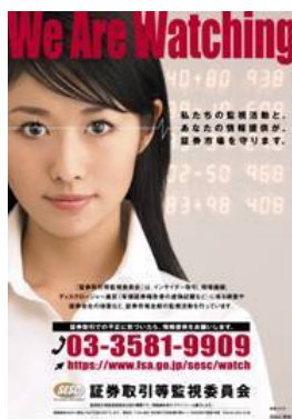
Poster calling on the general public to provide information

To submit information via the internet, please access the Securities Watch & Report Portal on the SESC website (Available in Japanese only).