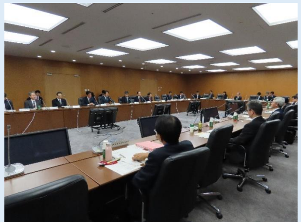
Photo: Meeting of Directors-General of Local Finance Bureaus

..... At the Meeting of Directors-General of Local Finance Bureaus, the speeches by the State Minister and the Parliamentary Vice-Minister came before Directors-General of Local Finance Bureaus and senior FSA officials exchanged opinions on current challenges in financial administration and FSA initiatives. The participants shared the awareness concerning those challenges and confirmed that the FSA and Local Finance Bureaus will continue joint efforts for addressing them. .....