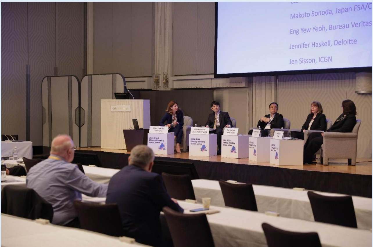
Photo: Breakout session on sustainability assurance