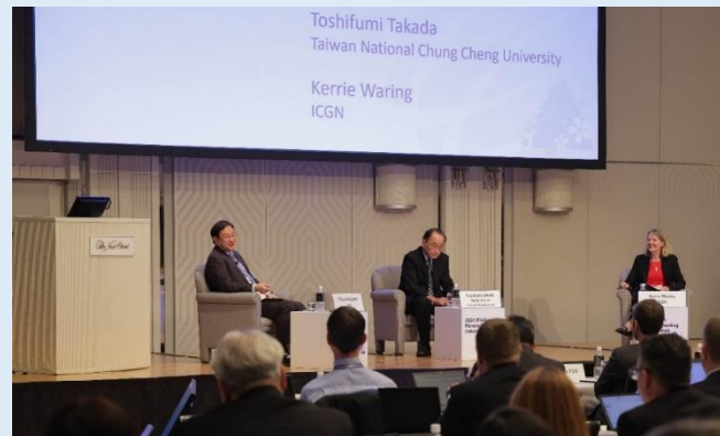
Photo: Keynote address and panel