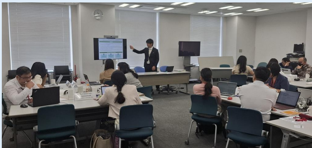
Photo: Lecture by FSA personnel