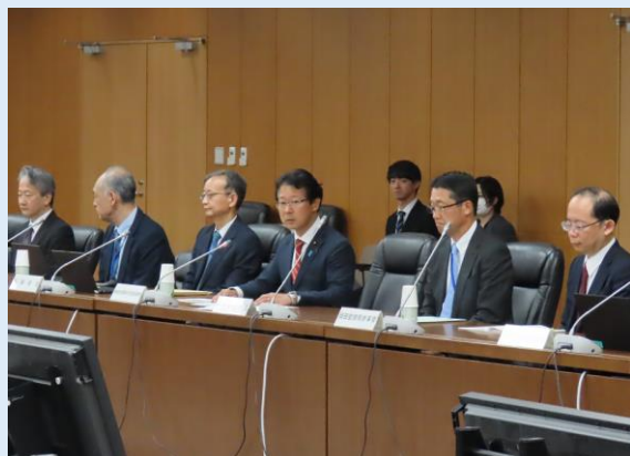
Photo: Meeting of director generals of local finance bureaus

At the meeting of director generals of local finance bureaus, in addition to an address by the Parliamentary Vice-Minister, director generals of local finance bureaus and senior officials of the Financial Services Agency exchanged views on issues such as immediate problems in financial administration and the Financial Services Agency's initiatives. We shared our understanding of these issues with director generals of local finance bureaus, and confirmed that the Financial Services Agency and local finance bureaus will continue to work together on these issues.