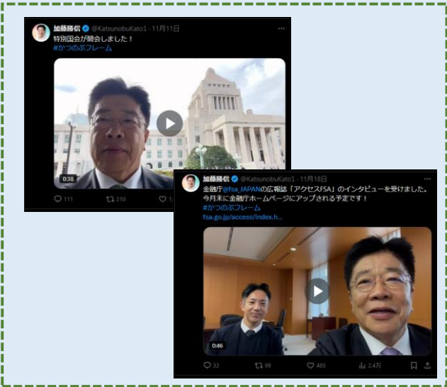
"# Katsunobu Frame"

(Interviewer: HONDA Koichi, Director of the Public Relations Office)