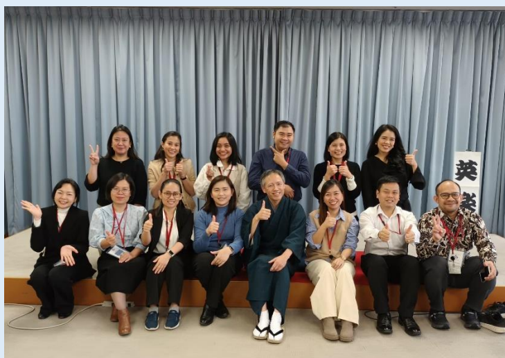
Photo: Promotion of exchange through Japanese culture

👉 The details of the Fellowship program for this term will be posted on the GLOPAC dedicated web site at a later date. Also, the past results are posted on the same website, so please take a look.