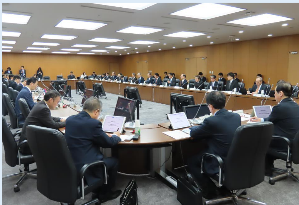
Photo: Meeting of director generals of local finance bureaus

Cybersecurity risks are increasing day by day along with technological developments and rising geopolitical risks. Financial institutions need to constantly improve their cybersecurity. In October this year, the Financial Services Agency revised its supervisory guidelines for each financial sector and newly formulated the Guidelines on Cybersecurity for the Financial Sector to clarify measures required for financial institutions. In the same month, Delta Wall IX(a financial sector-wide cybersecurity exercise) was implemented with the participation of 170 financial institutions to confirm their cybersecurity posture to system outages.