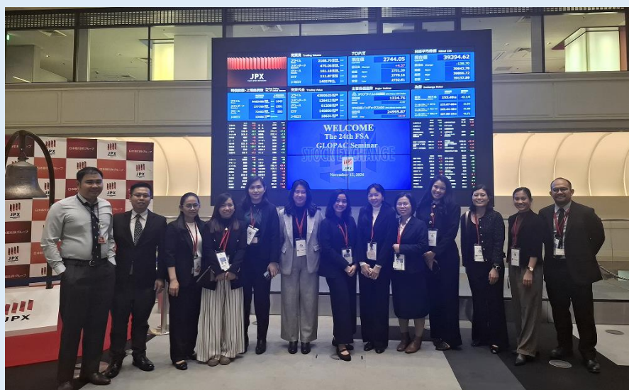
Photo: Study visit to JPX