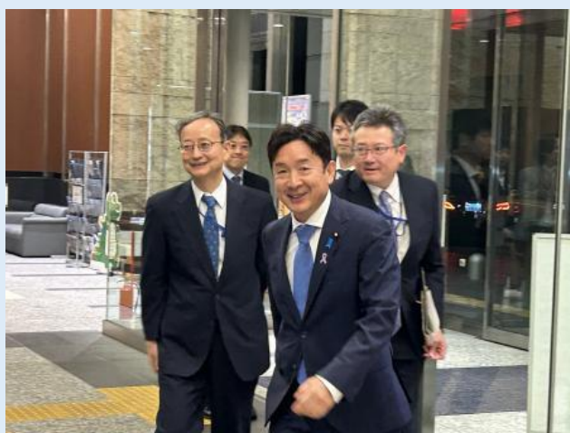
Photo: State Minister Mr. Seto attending the office for the first time