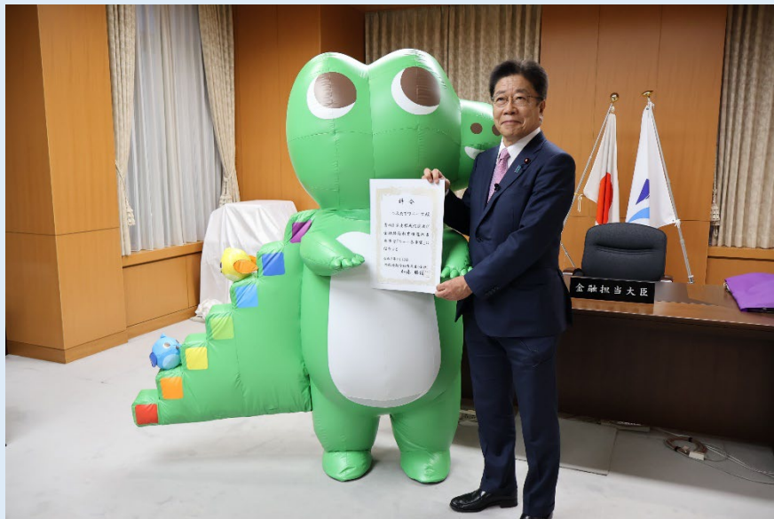
Photo: Letter of appointment delivered to the “Deputy Director-General, Wanny” by Mr. Kato, Minister of State for Financial Services

On February 13, as the NISA Day this year, Tsumitate Wanisa,* the FSA’s official character supporting dollar-cost averaging investments using NISA, was appointed as the “Deputy Director-General, Wanny.” (Note)