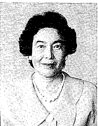
Commissioner Ginko Sato