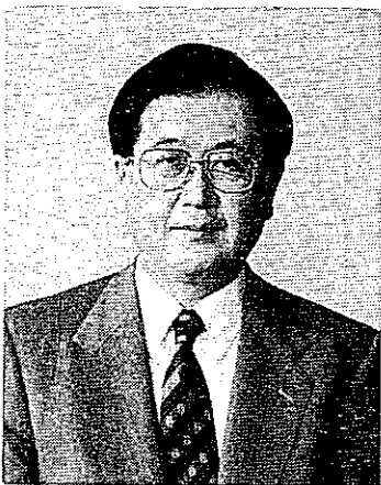
Commissioner Masamichi Narita